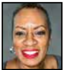
SPRING CAPERS Owner and CEO Spring's Place – The Hair Studio