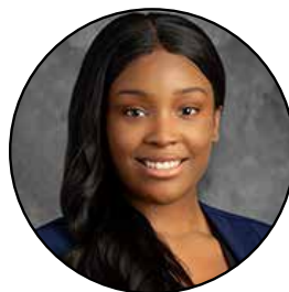
ESSENCE SMART STUDENT TRUSTEE (2021 - 2023)