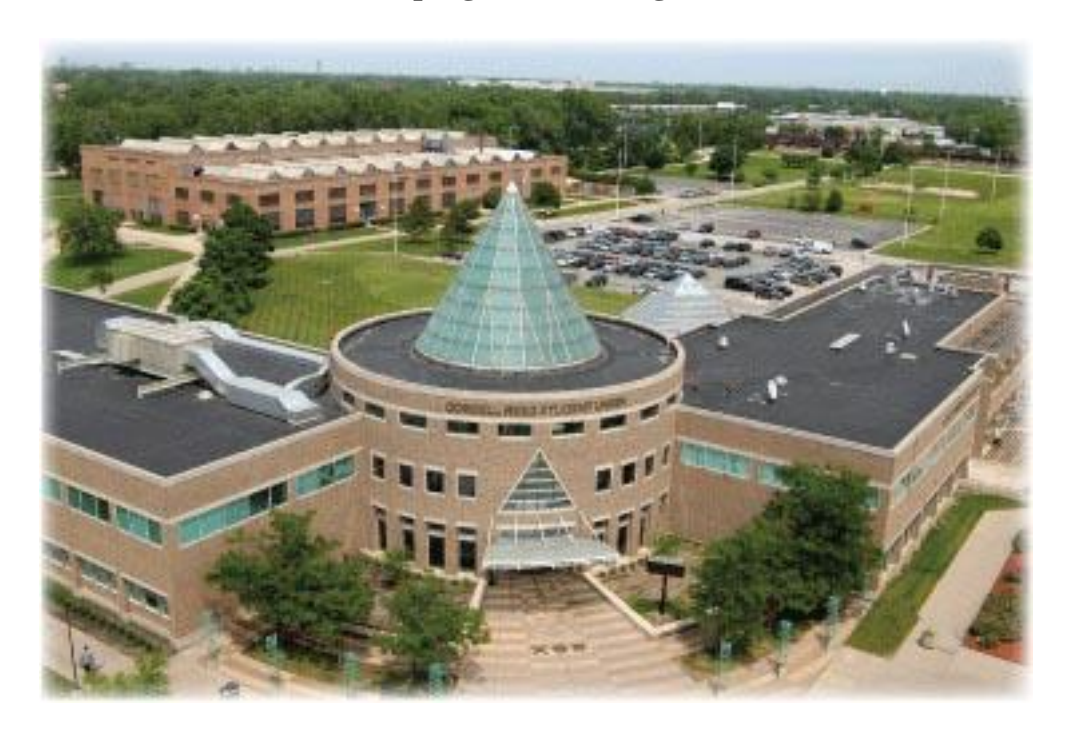
Bilingual Education Program

Portfolio Guidelines for Teacher Candidates Enrolled in the BIL initial licensure programs (Undergraduate and MSEd)