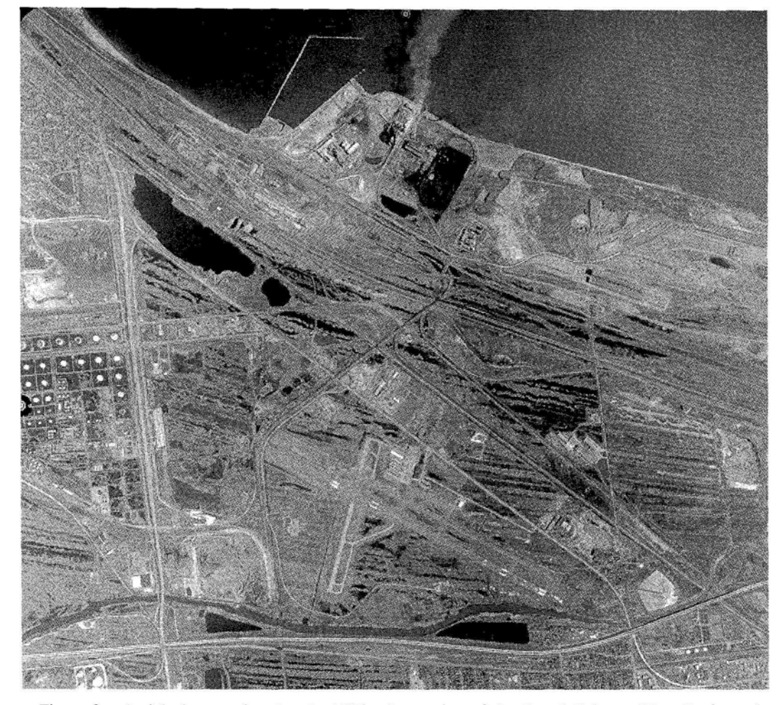
Figure 2.—Aerial photograph, taken in 1975, of a portion of the Grand Calumet River Basin study area, with Lake Michigan to the north. Compare with Figure 1 (facing page).

questions, the U.S. Army Corps of Engineers developed a remedial action plan with research and consultation conducted by scientists intimately familiar with the ecosystem and its components. The following papers are the culmination of these efforts and an attempt to answer the first four questions; the last question can only be answered after implementation of a restoration plan.