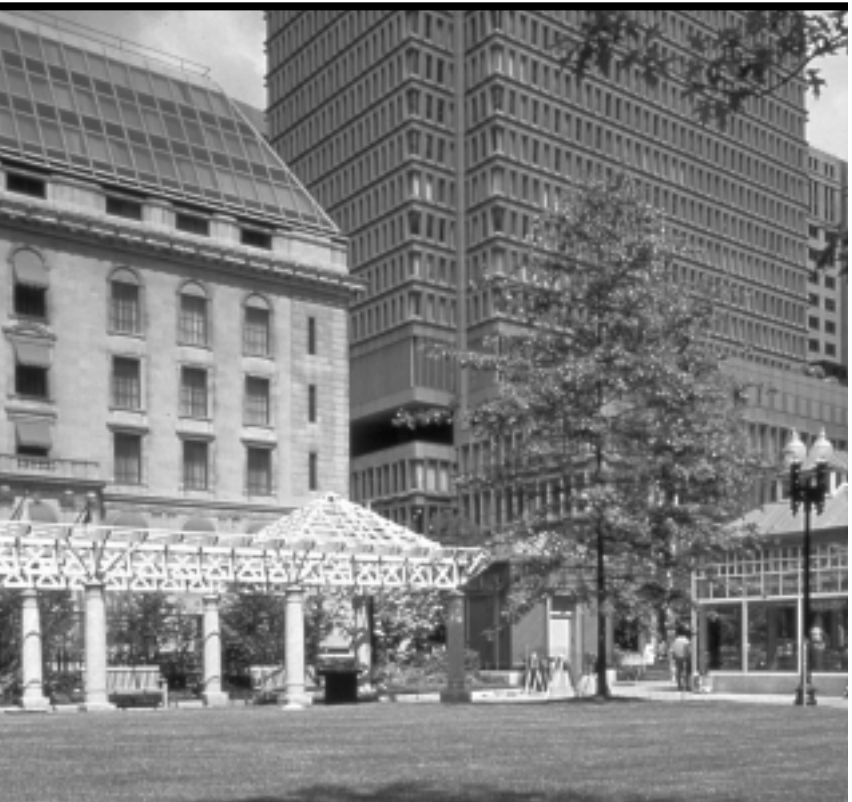
It's only 1.7 acres, but Boston's new Post Office Square Park has revolutionized the look, feel, and desirability of working in the city's financial district.

From the very beginnings of the park movement there has been interest in what makes for excellence. At first attention was focused on individual parks; later the inquiry was expanded to what constitutes greatness for a whole system. But each