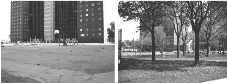
Figure 1: Attrition Has Left Some Buildings Surrounded Almost Entirely by Concrete and Asphalt and Others With Pockets of Green