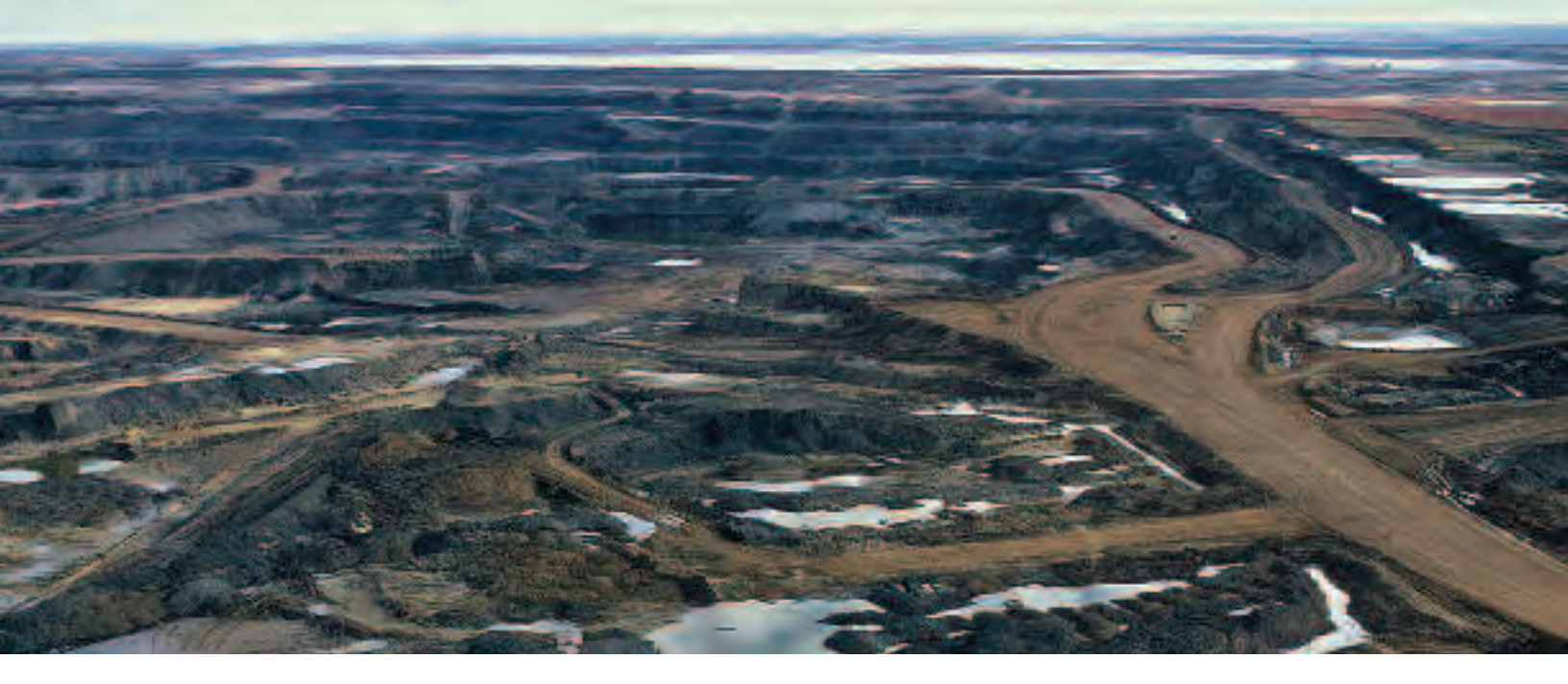
→ Tar Sands strip mining.

Canada's National Energy Board has warned that: "the principal environmental threats from tailings ponds are the migration of pollutants through the groundwater system and the risk of leaks to the surrounding soil and surface water.... the scale of the problem is daunting and current production trends indicate that the volume of fine tailings ponds produced by Suncor and Syncrude alone, will exceed one billion cubic metres by the year 2020."<sup>28</sup>