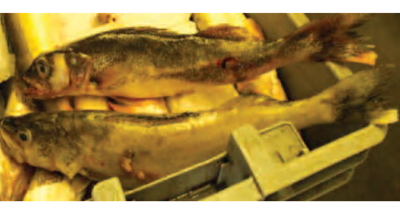
→ These walleye caught in Lake Athabasca in 2007 exhibit external tumors, lesions, deformed spines, bulging eyes, abnormal fins and other defects.

The levels of toxic chemicals are already dangerously high and they are rising as Tar Sands development booms.9