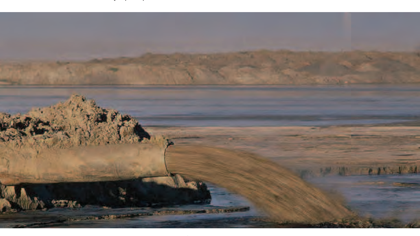
→ Tar Sands toxic ponds are already visible from space.

Environment Canada estimates that Tar Sands releases of benzene are now about 100 tonnes per year, and could grow to 500 to 800 tonnes per year by 2015.<sup>39</sup>