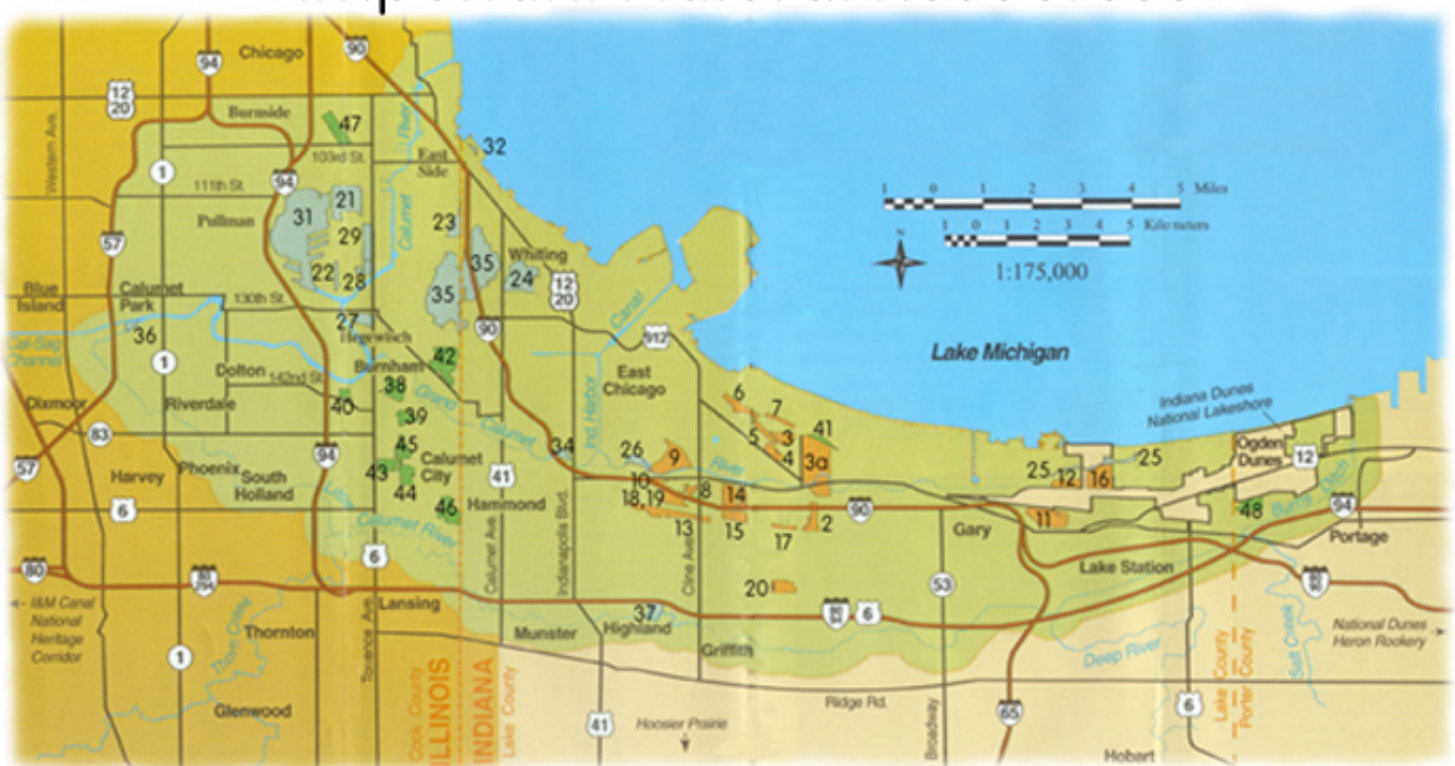
Map adapted from National Park Service's Calumet Ecological Park Feasibility Study, 1998 Data Sources: U.S. Geological Survey, U.S. National Park Service