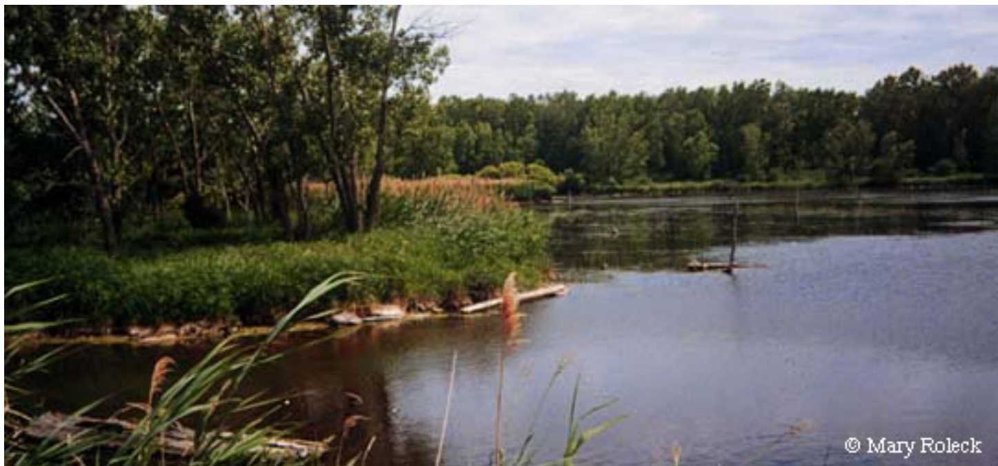
O'Brien Lock Marsh