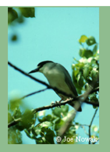
Black-crowned Night-Heron up close at Lake Calumet wetlands.