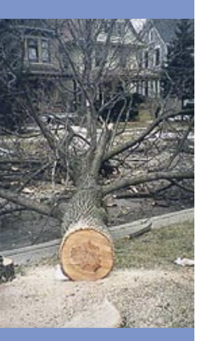
chopped down this large ALB-infested tree in front of the Ravenswood home where Gina Bader lived