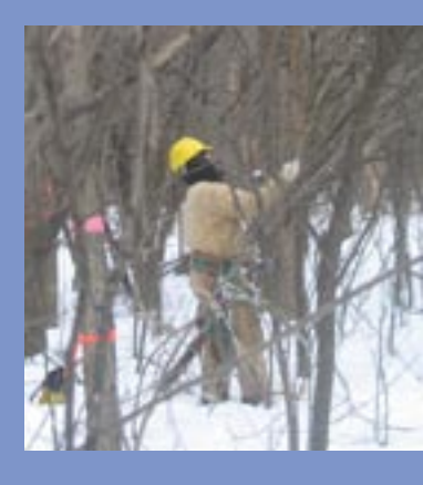
Surveys continued year round, even in the cold and snow

The day the trees came down was still an awful day. It was horribly damp and cold and drizzly. The city was so incredibly efficient at getting all the cars to park somewhere else and worked methodically to remove all the infested street trees. The Street and Sanitation crews were out in full force and were incredibly efficient. It seemed like in no time at all the trees were gone. There were clusters of people everywhere watching—under porches, from windows, under umbrellas. There