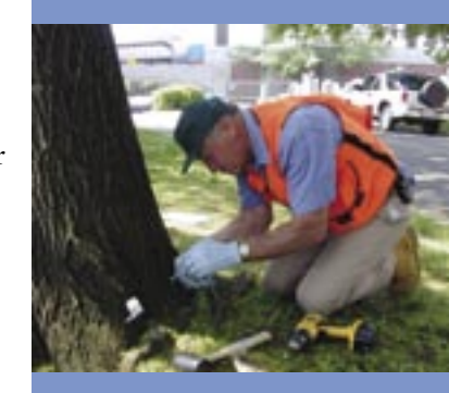
USDA APHIS Researcher insecticide imidacloprid into an ALB host species tree

At the end of the 2003 ALB season, Chicago was in its fourth year of treatment and New York completed 3 years in selected areas.