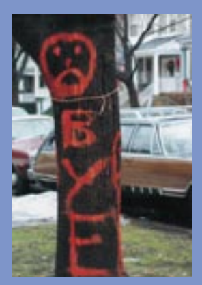
Ravenswood residents found a variety of ways to express their sorrow over the tree loss Photo by Victoria Deloria

down in the Ravenswood February of 1999 Photo by Victoria Deloria