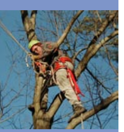
climber checks trees for ALB

Sometimes they're scary to watch when they're up in those trees, but they do the job for us." Between the bucket trucks and the tree climbers, the surveyors were able to double the number of infested trees identified before the beetles began to emerge again in the late spring of 1999. Crews of USDA Forest Service and contract climbers now work throughout the year doing inspections in both Chicago and New York.