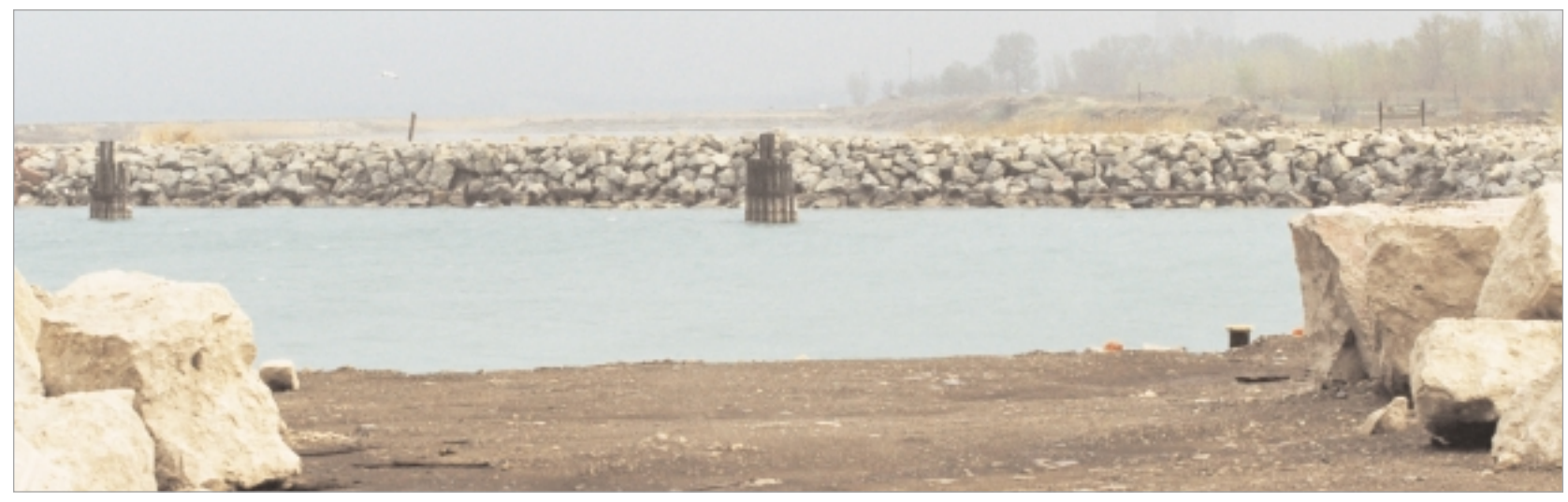
Lake view of former U.S. Steel site

Army Corps parcel will now become a part of the Phase I Lakefront Park development. The entire Lakefront Park will consist of 100 acres of the former U. S. Steel site.