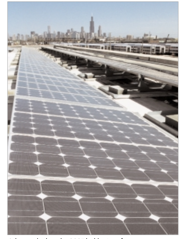
Solar panels along the CCGT building's roof

The CCGT building is an integral part of the City's plan to generate 20 percent of its electrical power from alternative sources.