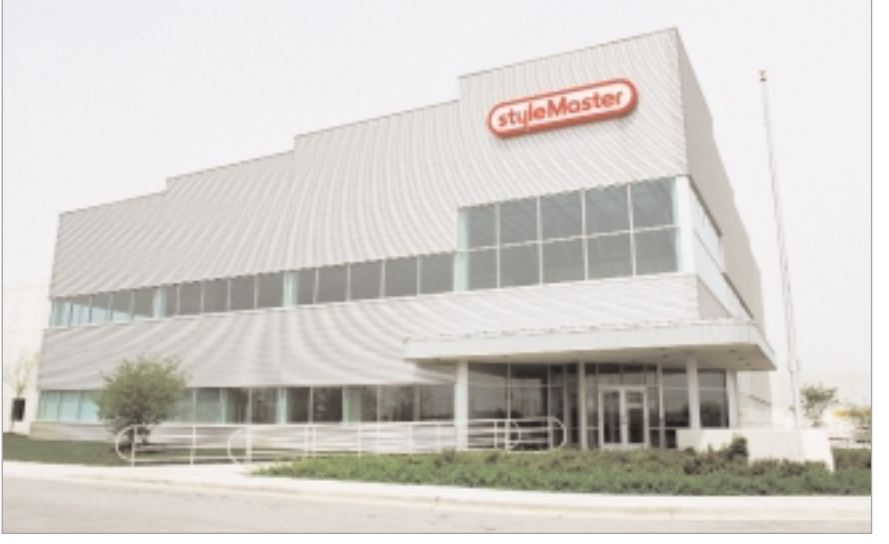
StyleMaster sits on a former brownfield

This property had been the home of a drive-in theater and a flea market after the mid-1900s. From 1980 to the mid-1990s, 600,000 cubic yards of concrete, asphalt, construction and demolition debris, soil, rubbish, and hazardous automobile shredder residue found their way into the site to form what was considered an environmental disaster.