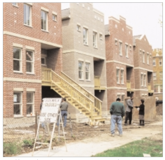
Neighbors welcome similar new construction in the area

This abandoned, blighted property sat mostly vacant and in poor condition for years. The site has been used for industrial and commercial purposes since before 1895. Historical operations included a carriage and automobile manufacturer and warehouse, and a painting and metal refinishing company. The site was contaminated by chemicals associated with these historical activities. But upon this site, the City is creating a community, and it will be a jewel when completed.