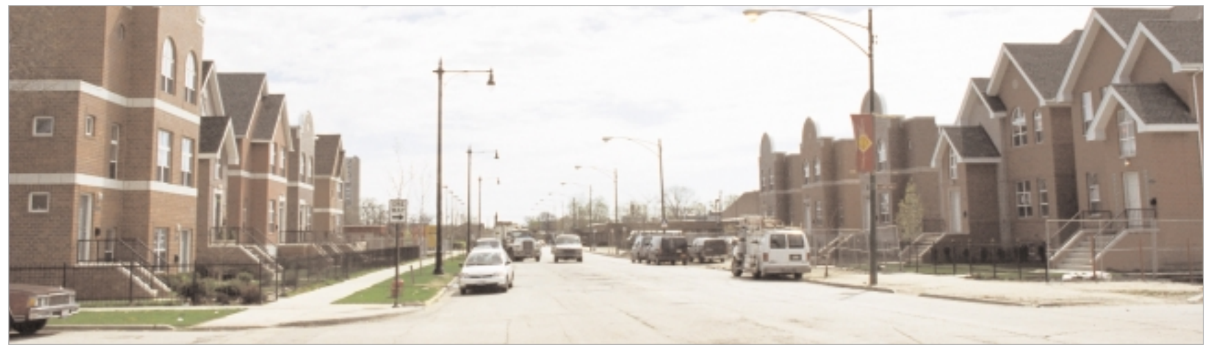
View of 63rd Street at Columbia Pointe; Bottom: Theodore Baughn and Kendall Cunningham, new residents of Columbia Pointe