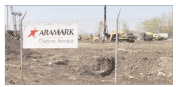
Construction has begun at the new Aramark manufacturing facility

Today, it's a place of opportunity where 90 new jobs will be created and 217 jobs will be retained. This site is the future home of Aramark, a company that will build a 125,000 square foot manufacturing and warehouse facility. This rede-