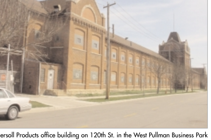
Former Ingersoll Products office building on 120th St. in the West Pullman Business Park

Deputy Commissioner, City of Chicago, Department of Planning and Development