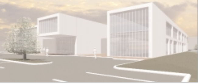
Future headquarters of the International Union of Operating Engineers Local 399

Construction on the $4 million, 30,000 squarefoot Operator's Union training facilities will begin in the summer of 2003. Six classrooms, office and lab space are planned and the site will have parking for 300 students. It is expected that as many as 3,500 students of building trades will receive training at the facility each year. For businesses in nearby Chinatown, it will be a positive development.