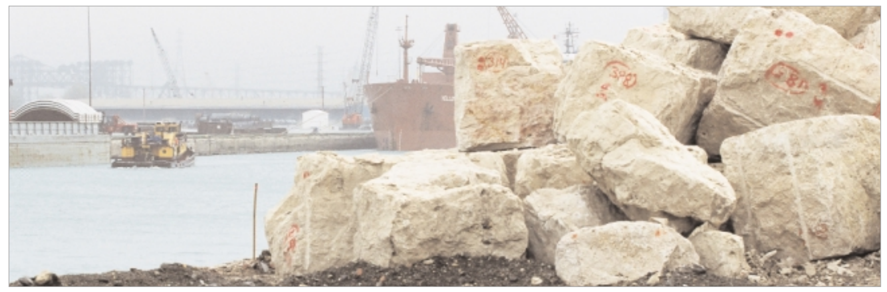
Prime docking space at the former U.S. Steel site

The exchange required the City to clean up the Army Corps' parcel, while the Army Corps committed to building a road to serve their new docking area.