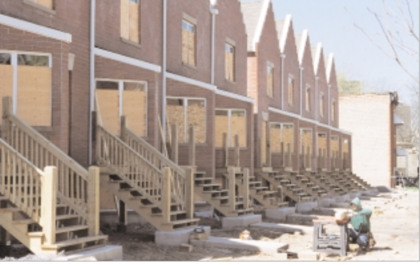
33 families will live in this new development on 40th Street