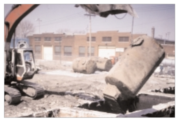
Underground storage tank being removed from site Above right: The new ATA training center will inject new life into the area

What was once a 26-acre trucking facility near Midway Airport will become an 188,000 square-foot training and operations facility that will house several Boeing 737 Next Generation Flight Simulators and a Boeing 757 Full Flight Simulator. The new complex, developed by ATA, will include a hotel and restaurant, aircraft-cabin simulators, a water-safety training pool, crew-trainer administration space, and state-of-the-art training devices for pilots, flight attendants, maintenance, line, and customer service personnel — all of this on a former brownfield.