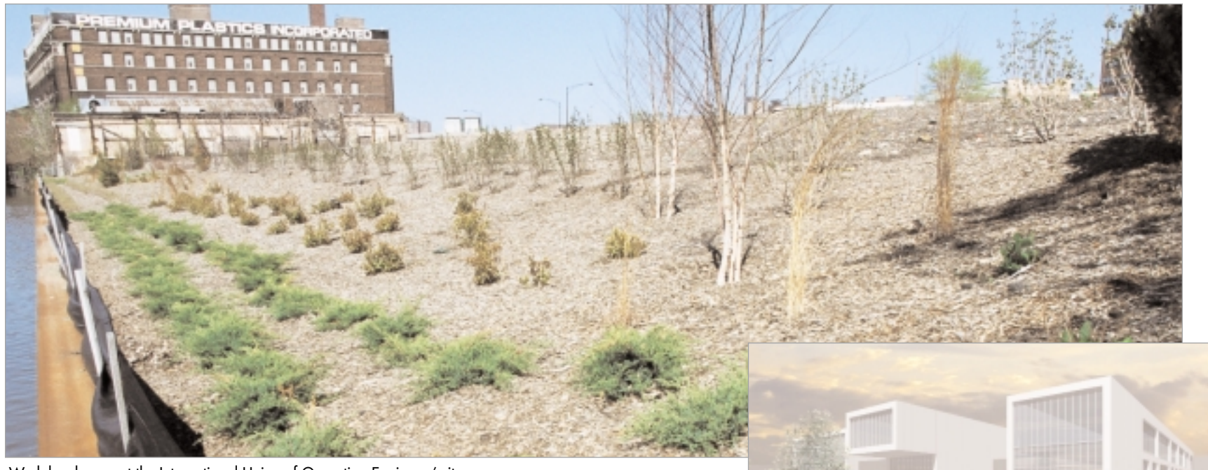
Work has begun at the International Union of Operating Engineers' site

time consuming process, the buildings were candidates for implosion, essentially collapsing the buildings onto their own footprints. In 1995 the buildings were safely and efficiently demolished in an implosion that lasted less than 10 seconds at a cost of $1.364 million.