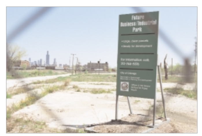
Future site of a vibrant business park

A showpiece of economic development in the Western Ogden Industrial Corridor, this industrial park is expected to generate nearly 600 jobs and annual tax revenue of $2.3 million. But the California Avenue Business Park's impact on the area will go far beyond the creation of jobs and tax revenue.