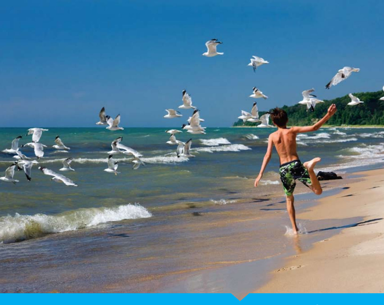
2009 Annual Report