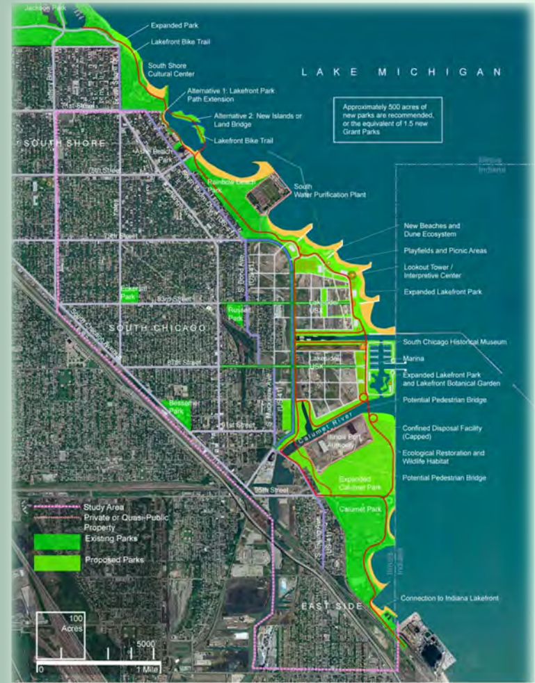
Completing the South Lakefront Parks: The Last Four Miles SOUTH LAKEFRONT: PROPOSED PLAN

The trail will bring riders to Chicago when linked to the Last Four Miles of the Lakefront Trail.