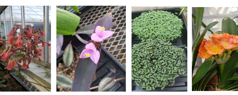
CSU Greenhouse Spring 2020